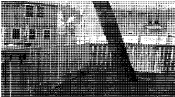
4 Foot picket example